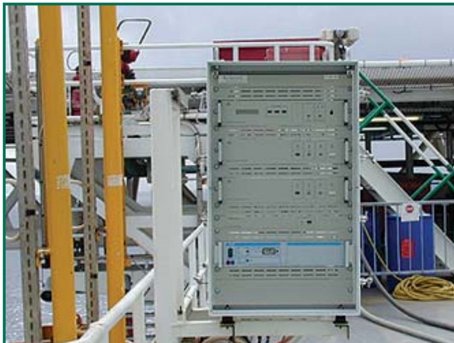
RBT9300P NDB + VHF 50W RACK 19"